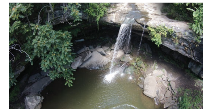
Beaver River. Surrounded by a variety of beautiful trees, the park provides a passive recreational opportunity that focuses on the unique natural resources present.

Formed back when glaciers began melting, Buttermilk Falls cascade over massive layers of sandstone creating a crescent rock arc above and a deep plunge pool below. The scenic falls occur on Clarks Run, a tributary of the